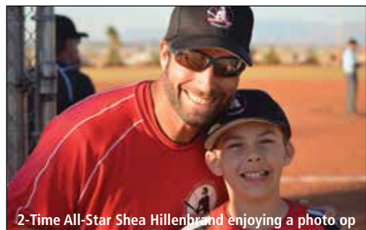
2-Time All-Star Shea Hillenbrand enjoying a photo op

During Camps, July 25 to Sept 1, Phone : 250-498-2259