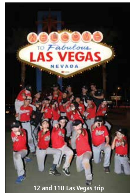
12 and 11U Las Vegas trip

Players are selected from the BLE summer camps to form teams that travel to Las Vegas and Phoenix (during MLB Spring Training) to take part in highly competitive tournaments. Prior to the tournaments, mini-camps are provided to build team chemistry and fine tune the players with a coaching staff that is second to none.