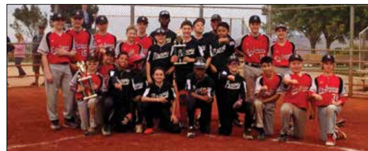
Team BLE's 12U squad display hardware after well fought battle vs Team Illinois

Milwaukee Brewers Scout Team: BLE Camps are used as identifiers for potential players to represent the Milwaukee Brewers organization at Perfect Game events and other elite Showcases - A great opportunity to be seen by MLB scouts and Collegiate Recruiters.