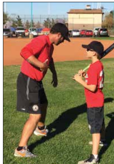
2-Time All-Star Shea Hillenbrand giving hitting instruction

During Camps, July 25 to Sept 1; Phone : 250-498-2259