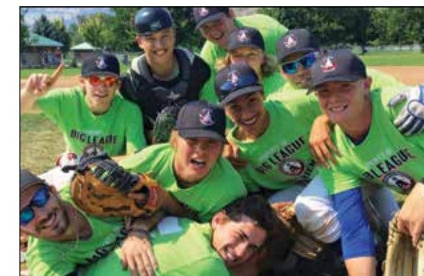
DOGPILE! The Tropics win the Showcase week Championship!