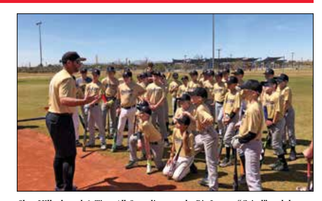
Shea Hillenbrand, 2-Time All-Star, discusses the Big League "Grind" and the hard work necessary to succeed!