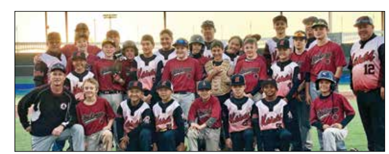
What a treat as Team BLE has Photo Op. after well fought battle vs. Team Hawaii

Team BLE Scout Team: BLE Camps are used as identifiers for potential players to represent the Team BLE at Perfect Game events and other elite Showcases - A great opportunity to be seen by MLB scouts and Collegiate Recruiters.